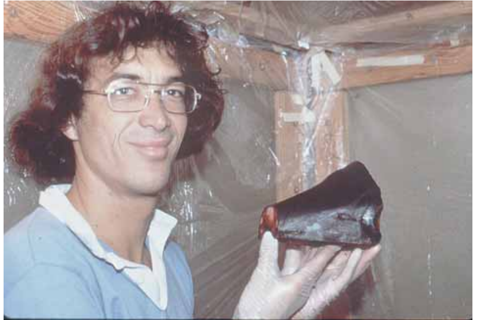
Hakarite ana i tētahi mātenga takeketonga 45 i roto i te taiwhanga mā (ko te pōraka whutupāoro mai i te kura tuarua o Mount Albert Grammar).

“He māmā noa iho, erangi ko te tino pūtake hei āwhina atu i a rātou ki taua tūtakinga ohore nui o ngā tikanga a iwi kē. Kua ahū mai te nuinga o rātou i ngā paenga o ngā kāinga o Tāmaki, mai i te tonga, te uru, Te Raki Paewhenua me ngā tuāwhenua. Kua tae mai rātou i ngā kura he nohinohi noa iho ngā karaehe Tau 12 me te Tau 13, te nuinga he kanohi parauri. Ka tae mai rātou ki konei ki ngā karaehe atu ki te kōtahi mano te nui, ko rātou hoki te itiiti. He ohore nui, ka tāpiri ki runga i te oho o te haerenga mai i ngā kura tuarua ki te Whare Wānanga nei.”