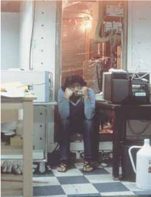
E kōrero ana i runga i te waea i te mutunga o tētahi rā e kaha ana te mahi ki te hakarerekētia mai i te taiwhanga papawhenua hei taiwhanga mā mo te hakamātautau i te hautonga i roto i ngā kararehe.