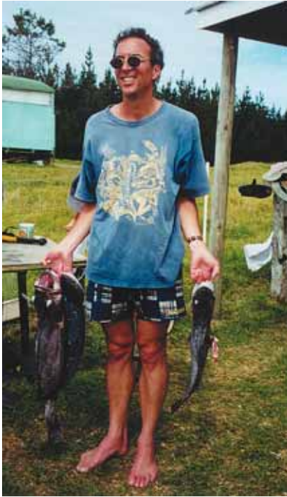
Ngā maunga ika o te ata ki Whananaki