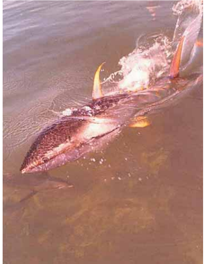
He tuna uwaha i roto i te taiwhanga kura wai - Ngā Ratonga Ika Moana-Ā-lwi, Te Taiwhanga Kewalo, Honolulu, Hawai'i.

Mai i tērā wā ka mahi tonu ki tāna mahi e pā ana ki te rongo hautō a ngā kararehe. Kua mahiatahi e rātou ko āna ākongā me te taraute, ngā kukupā hoki kāinga me ngā pī mīere, ka mea ia “he kararehe iti me te hakamīharo.” Nā tētahi o āna ākongā i hakararata ai i ētahi whai kia hakautu ki ngā maneatanga hautō. I te mea e taea e te whai te rongo i ngā