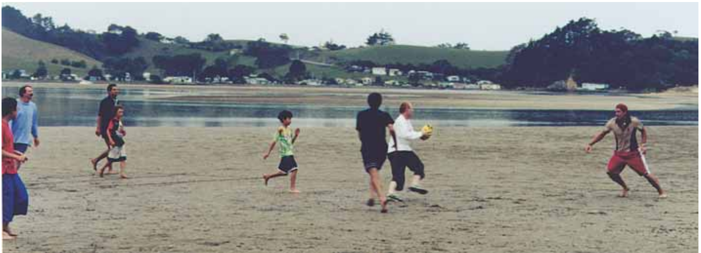
Kua timu te tai, ka pūreingia pā whutupāoro e te whānau katoa ki runga i te onepū o Whananaki.

Tonoa ngā patapatai me ngā tono ki: Te Ūepu Rōera o Aotearoa (Niu Tīreni), Pouaka Poutāpeta 598, Te Whanga-nui-ā-Tara Waea: (04)472-7421 Waea Hakaahua: (04)473-1841 Īmēra (Ipurangi): sales@rsnz.org ISSN 0111-1957 ISBN 1-877317-03-9 Ngahuru-Hangarua 2004 Te Ūepu Rōera o Aotearoa (Niu Tīreni)