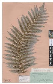
Figure 2: Cyathea dealbata Swartz