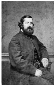
Figure 1: Johann Franz Julius von Haast

Julius von Haast Sir Johann Franz "Julius" von Haast was a German geologist, explorer and writer who founded Canterbury Museum in Christchurch New Zealand in 1861. 1 Haast was the provincial geologist of Canterbury from 1861-1871 and his explorations are remembered in New Zealand by locations such as the Haast Pass and Franz Joseph Glacier, which Haast named after the Emperor of the Austro-Hungarian Empire 2 . In his explorations, he collected many plants previously unknown to science, and many genera and species named after him today.