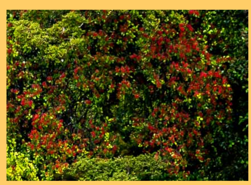
Mistletoe at Breaksea Sound, Fiordland.

Horticulture and agriculture rely on pollination too for the production of fruit and seeds. It's been estimated that around two-thirds of our fresh fruit and vegetables require pollination by animals. According to Federated Farmers, about $3 billion of our Gross Domestic Product is directly attributable to the intensive pollination of horticultural and speciality agricultural crops by honeybees. Unfortunately, reliance on honeybees is becoming increasingly risky due to the spread of varroa mites and other diseases.