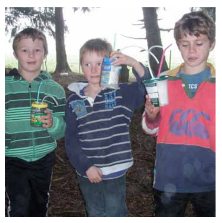
▲ Students from Knapdale School made their own aspirators to help them collect small insects without harming them.