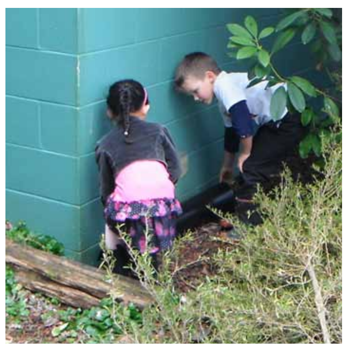
{\color{red} \blacktriangle} Students from Lochiel School set out tracking tunnels to find out what lives in their school grounds.