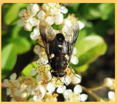
Gadsfly on the weedy shrub Cotoneaster lacteus.