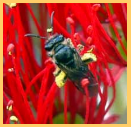
Native bee on põhutukawa.

Pōhutukawa and rewarewa flowers produce copious amounts of nectar to attract short-tailed bats.