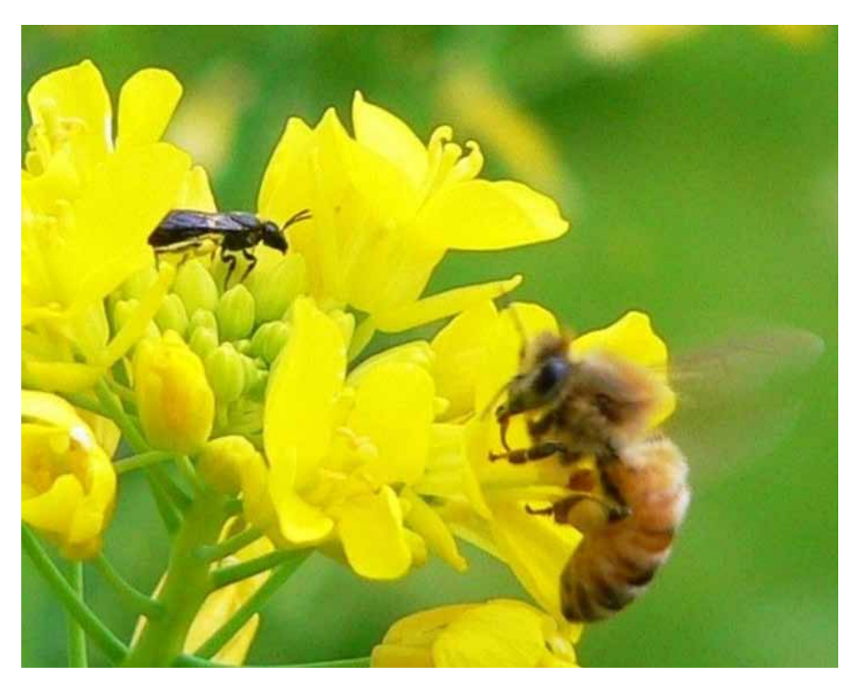
▲ Native bee (left) and European honey bee (right).

round the world and in New Zealand, extensive land-use changes and intensification of agriculture have led to decreases in flower abundance and diversity, and declining pollinator populations. Ongoing habitat loss has become a serious problem for threatened species of plants and animals. Both natural and agricultural systems have suffered losses of pollinators. The most obvious ones are the decline of feral (unmanaged) honeybees in agricultural ecosystems and the decline of birds and bats in natural ecosystems.