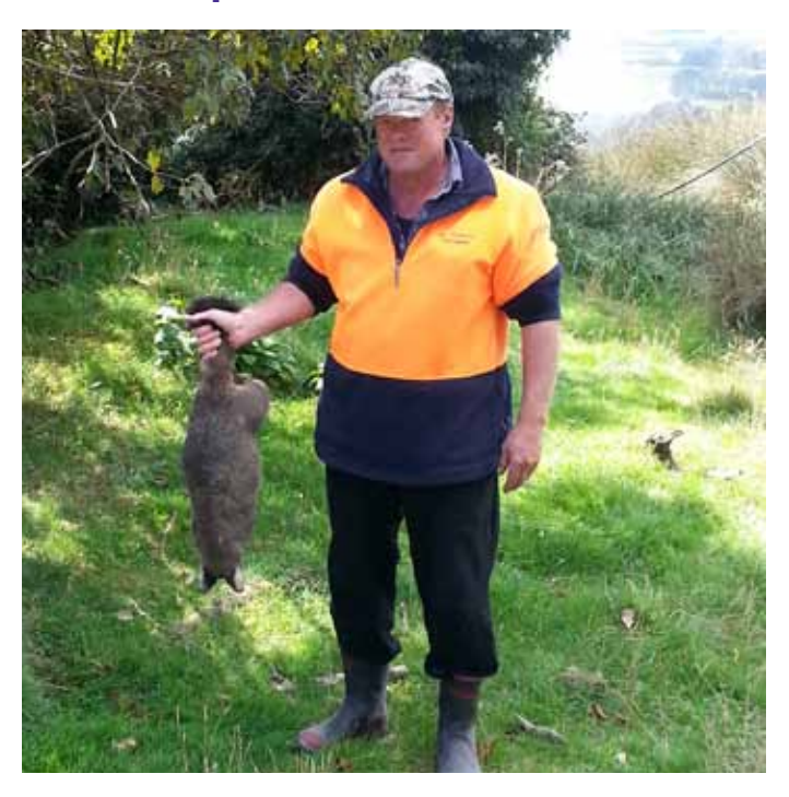
▲ Contractor carrying out possum control work in a QEII covenant.