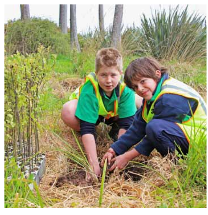
▲ Students from Heddon Bush School plant native seedlings at 'The Donut', a local area of bush with a QEII Covenant.