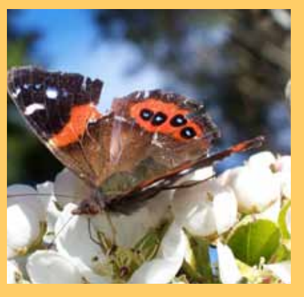
Red Admiral on pear blossoms.