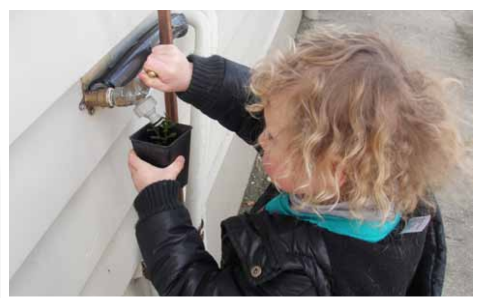
▲ Students from Pukerau School learnt how to grow their own native plants.