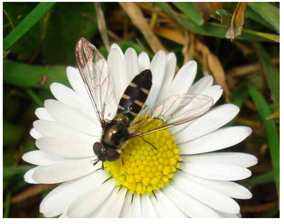
↑ Hoverfly on a flower at More's Reserve, Riverton.

In Southland we're blessed with extraordinary biodiversity in places like Fiordland and Stewart Island, and in our native forests, wetlands, scrublands, tussocks, alpine meadows and herb fields. These special areas provide refuges and food for native birds and wildlife and ecosystem services such as water filtration,