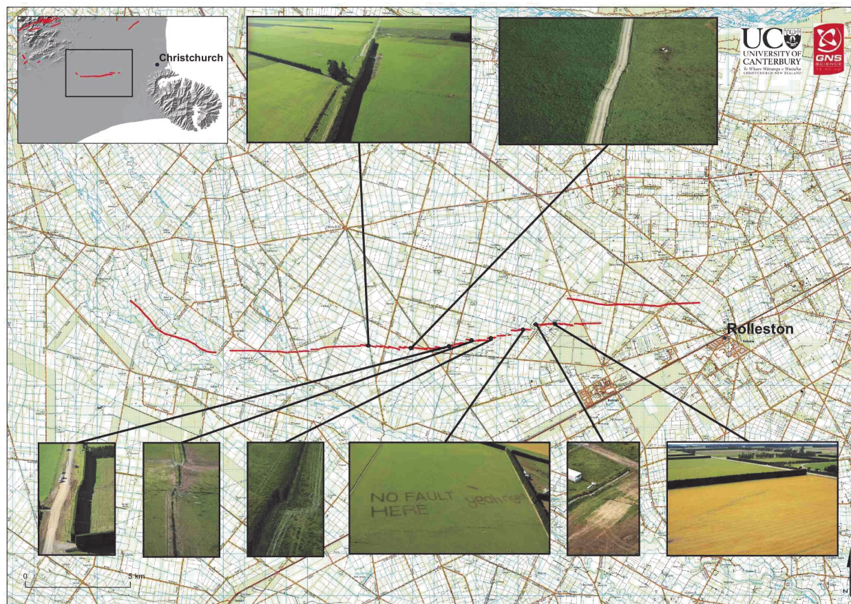
Figure 1 : Fault map of the Darfield earthquake.

In 1940 the El Centro earthquake in California was recorded by an accelerometer. These data provided much-needed information about the shaking that earthquakes cause and revealed that ground shaking could be much greater than assumed by simple loading analysis. This information, and the deployment of accelerometers in New Zealand, and better mapping of active seismic faults was used by Dr Ivan Skinner and others to update the seismic loading code published in 1965. This new code introduced the idea of different risk zones, with Wellington in the highest, Christchurch in the medium risk zone, and Auckland in the lowest risk zone. The zones implied nothing about the probability of earthquakes, but did describe the expected degree of shaking for each area.